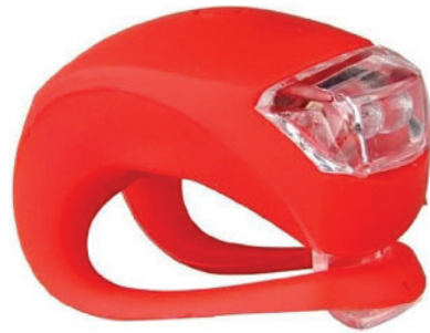
Fig. 1. An example of a red silicone LED bicycle light (available from many different manufacturers).

Sets of three photographs were taken of hands and feet (i) with no transillumination (control), (ii) with transillumination with a cold light, and (iii) with a red silicone LED bicycle light (Figs 1 and 2). Photos were taken in the Neonatal Intensive Care and Special Care Baby Unit in the normal clinical environment. Babies remained in their incubators, the background lighting being dimmed to the